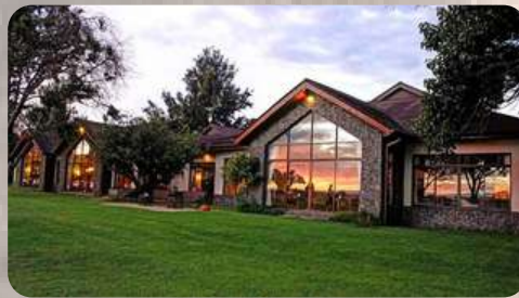
DAY 5: SERENGETI