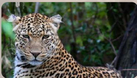
DAY 7: NGORONGORO