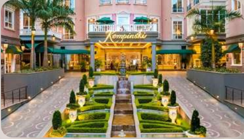
DAY 1: NAIROBI

A short snapshot of your trip taking you through 4 spectacular regions of Kenya and Tanzania.