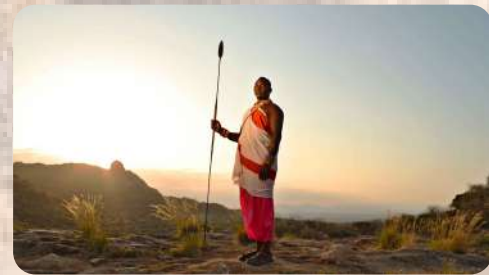
DAY 6: SERENGETI