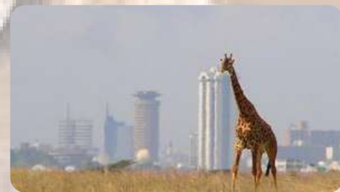
DAY 9: ARUSHA