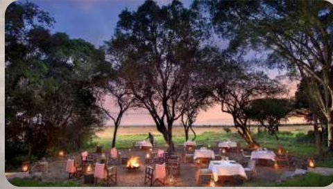
DAY 2: RIFT VALLEY