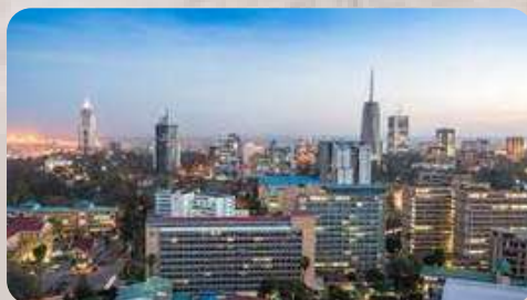
DAY 10: HOMEBOUND