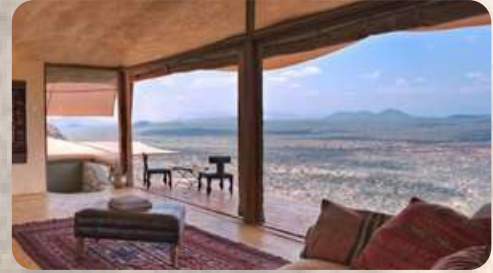
DAY 3: MASAI MARA