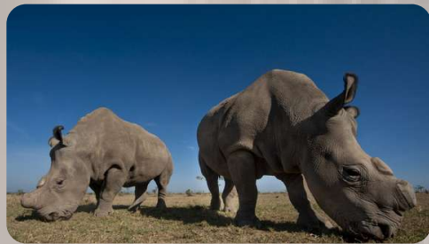
DAY 4: MASAI MARA