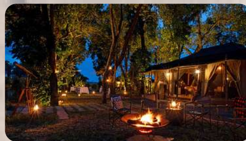
DAY 8: NGORONGORO