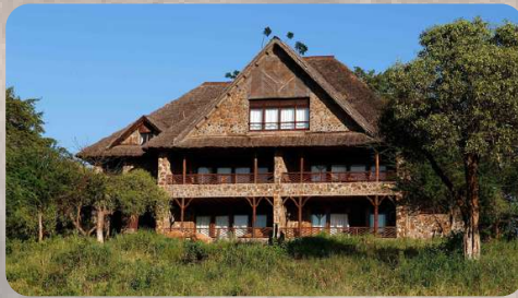
DAY 2: TSAVO