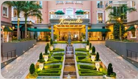
DAY 1: NAIROBI

A short snapshot of your trip taking you through 5 spectacular regions in Kenya. Experience the best of Kenya.