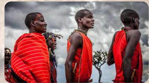
DAY 9: MASAI MARA