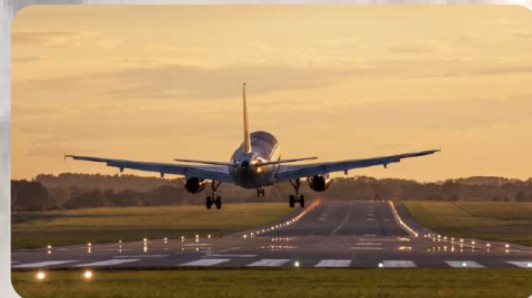
DAY 11: HOMEBOUND