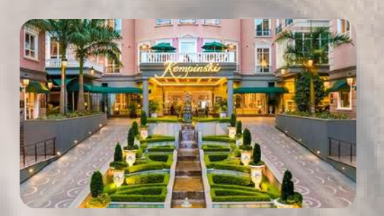
DAY 1: NAIROBI

A short snapshot of your trip taking you through 4 spectacular regions of Kenya