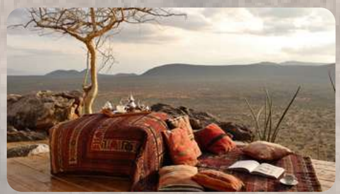
DAY 2: SAMBURU