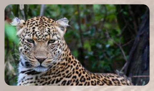
DAY 7: MASAI MARA