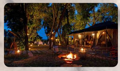
DAY 8: MASAI MARA