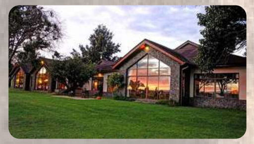
DAY 5: OL PEJETA