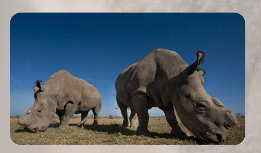
DAY 4: OL PEJETA