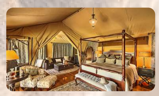
DAY 6: MASAI MARA