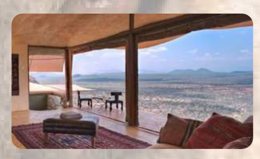
DAY 3: SAMBURU