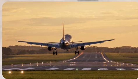
DAY 6: HOMEBOUND