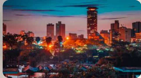
DAY 4: NAIROBI