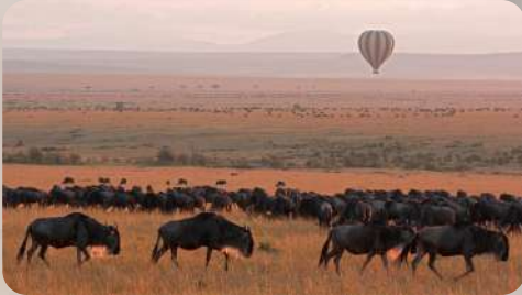
DAY 4: MASAI MARA