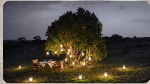
DAY 2: MASAI MARA