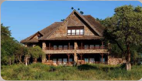
DAY 1: RIFT VALLEY

A short snapshot of your trip taking you through 2 spectacular regions in Kenya.