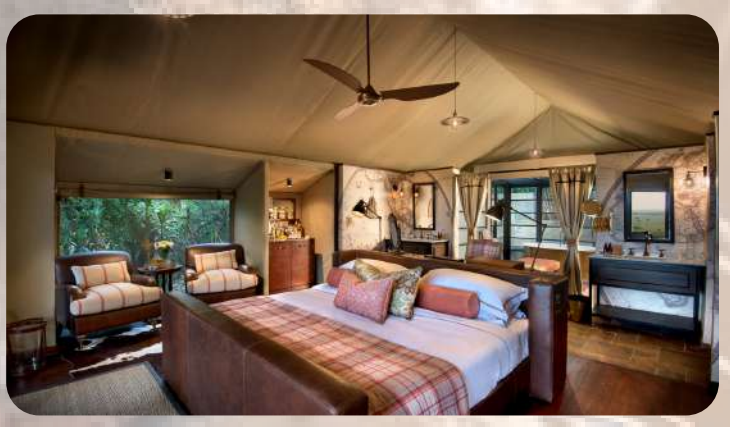
Day 7-9: MASAI MARA, KENYA Fly into the famed Masai Mara where the splendor of wildlife awaits you.