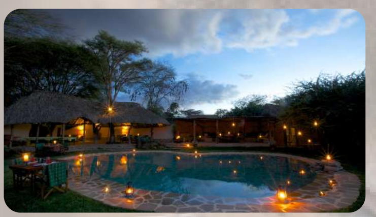
Day 5-7: LAIKIPIA, KENYA Arrive at laikipia, into a unique conservancy that hosts wildlife not seen anywhere else in East Africa