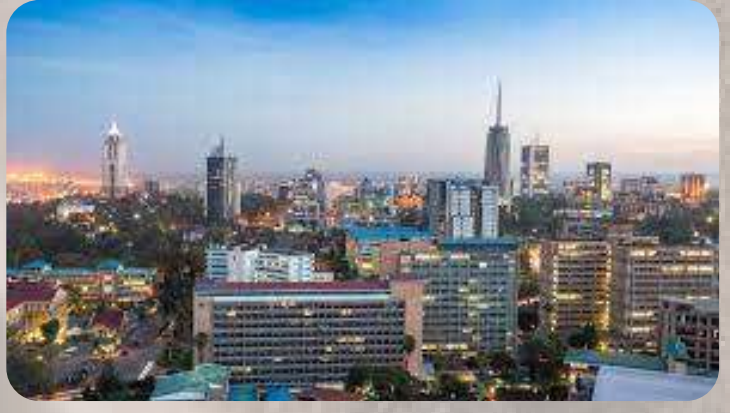
Day 1 -3 & 14: NAIROBI Be welcomed into the metropolitan city, the capital of East Africa, Nairobi.

short snapshot of our most exclusive package taking you through 6 regions between Kenya and Tanzania in spectacular luxury. An experience unmatched anywhere else in the world.