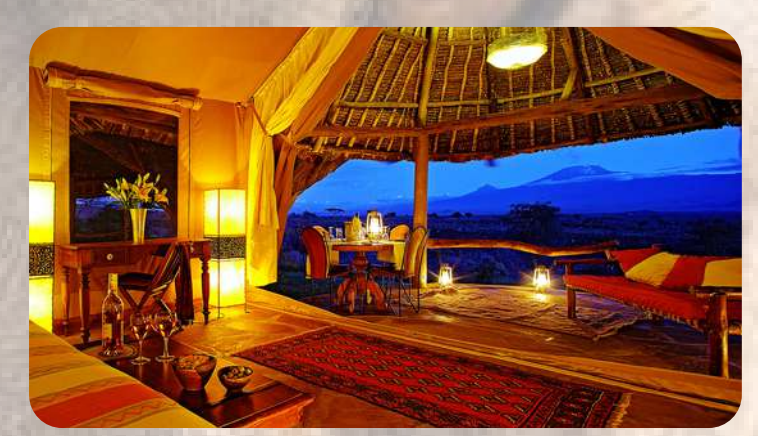
Day 3-5: AMBOSELI, KENYA fly to Amboseli, hosting the best views of mount Kilimanjaro and home to the elephants