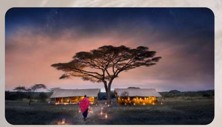
Day 9-11: SERENGETI, TANZANIA The extreme vastness and peace of the mighty Serengeti awaits you as you arrive