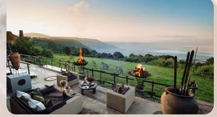
Day 11-13: NGORONGORO, TANZANIA A 3000 year old crater houses the probably the best views in the continent along with a secluded wildlife ecosystem