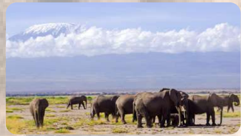
DAY 3: AMBOSELI