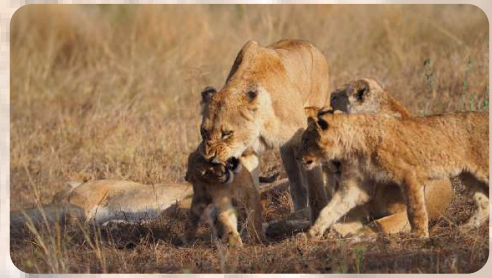
DAY 6: MASAI MARA