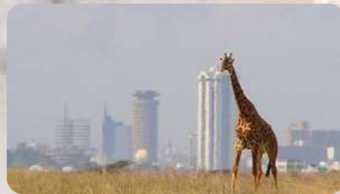
DAY 8: HOMEBOUND