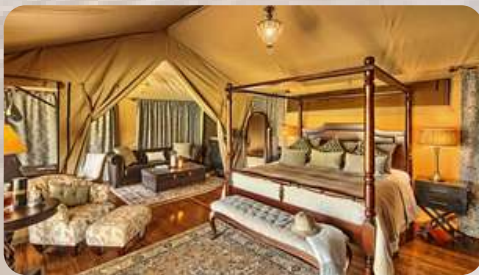
DAY 7: MASAI MARA