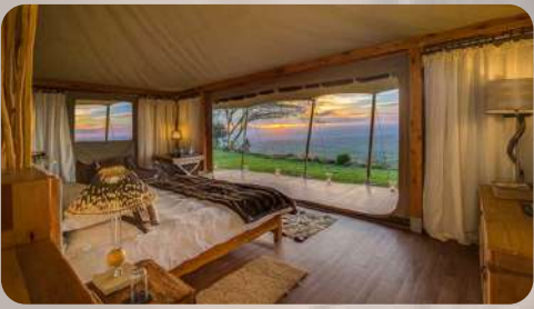
DAY 4: LOISABA