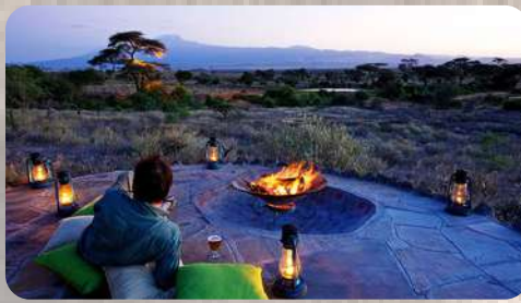
DAY 2: AMBOSELI