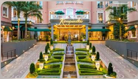
DAY 1: NAIROBI

A short snapshot of your trip taking you through 4 spectacular regions of Kenya. Experience a quintessential Kenyan wildlife safari.