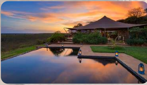
DAY 5: LOISABA